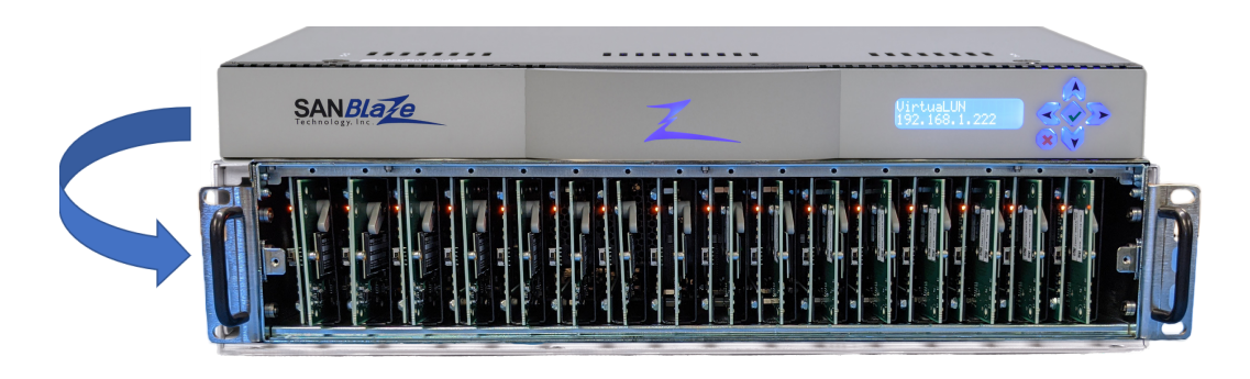
SANBlaze VLF Gen5 Server and SBExpress-RM5